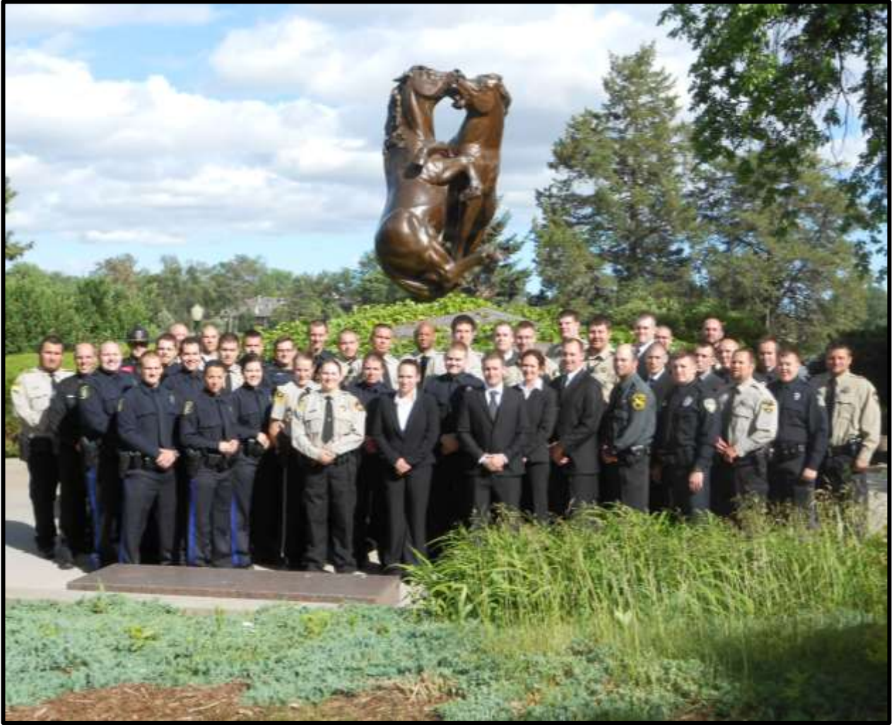
Students from the 161 st Session of the Basic Officer Certification Course held March 7, 2016 through June 3, 2016.