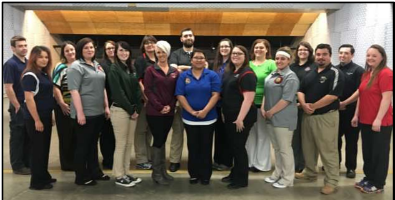
51 st 911 Telecommunication Class held February 22, 2016 through March 4, 2016.

White - A person having origins in any of the original peoples of Europe, North Africa, or the Middle East.