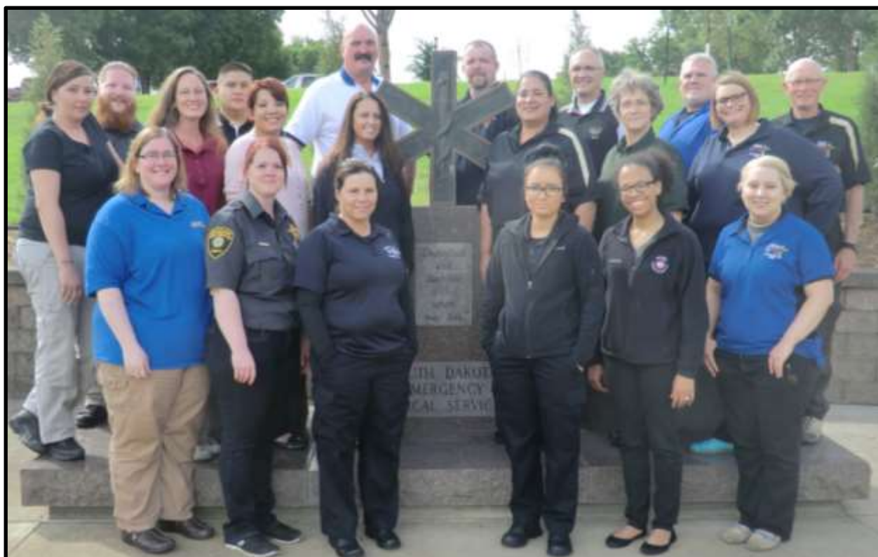
52 nd 911 Telecommunication Class held June 6, 2016 through June 17, 2016.