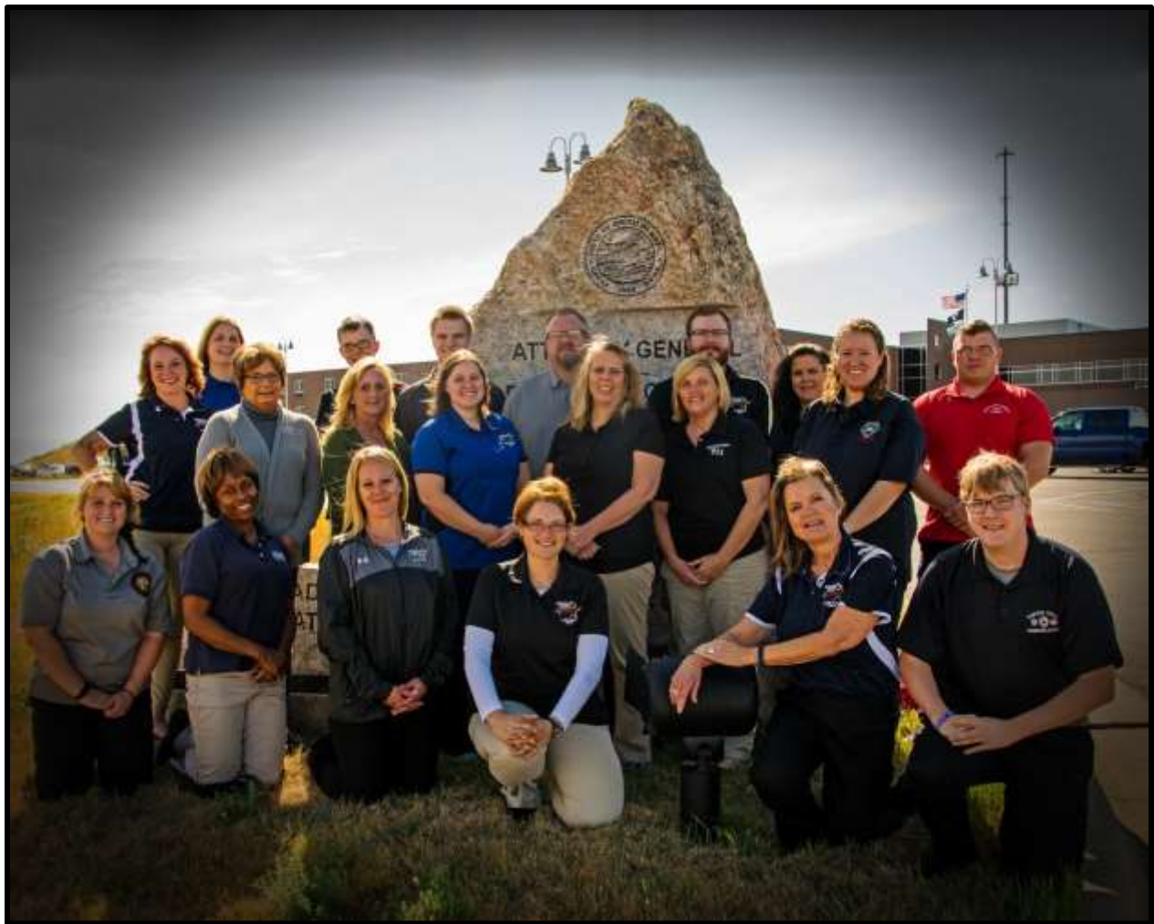
53 rd 911 Telecommunication Class held September 26, 2016 through October 7, 2016.

An offender's age, gender, race, ethnicity, etc. may be reported under more than one offense. Offender information is recorded under each offense committed by that Offender.