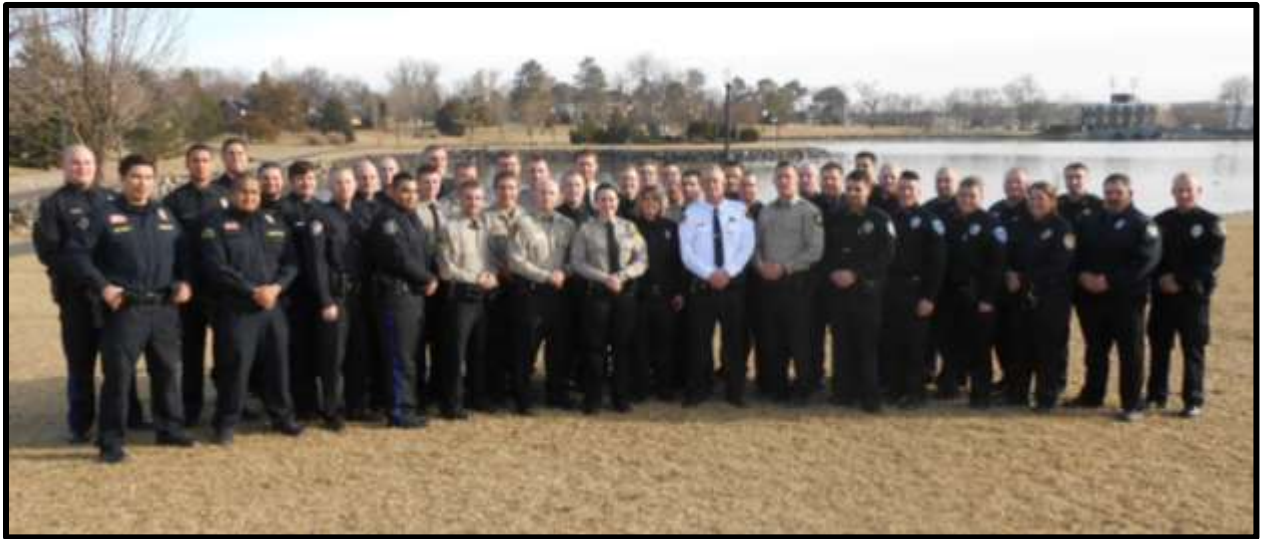
Students from the 160 th Session of the Basic Officer Certification Course held November 23, 2015 through February 26, 2016.

In NIBRS, incidents that do not involve any facts indicating biased motivation on the part of the offender are reported as "None", whereas incidents involving ambiguous facts (some facts are present but are not conclusive) are reported as "Unknown".