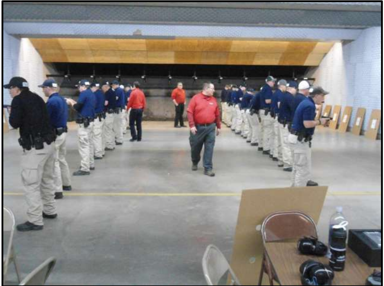
Law Enforcement Training Students participate in a firearms class as part of the Basic Officer Certification Course.