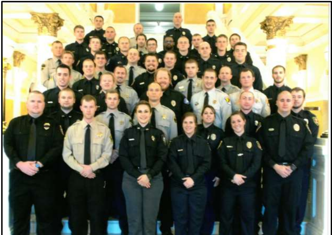
Students from the 162 nd Session of the Basic Officer Certification Course held August 22, 2016 through November 18, 2016.