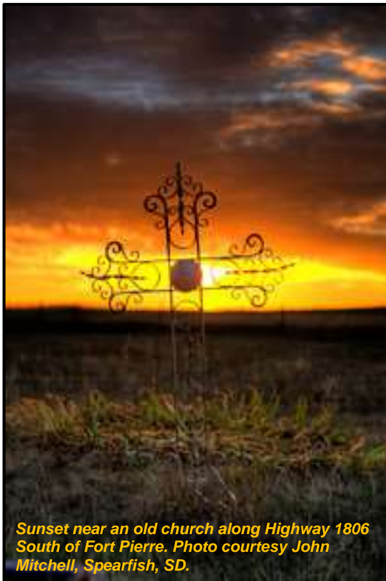
Sunset near an old church along Highway 1806 South of Fort Pierre.