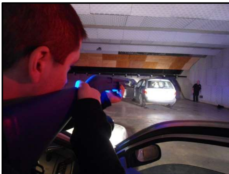
Law Enforcement Training Students participate in a night time vehicle stop exercise as part of the Basic Officer Certification Course.

This publication of Crime in South Dakota 2016 represents approximately 94% of the population as reported by 51 Sheriff's Offices, 57 Police Departments, Division of Criminal Investigation and SD Highway Patrol.