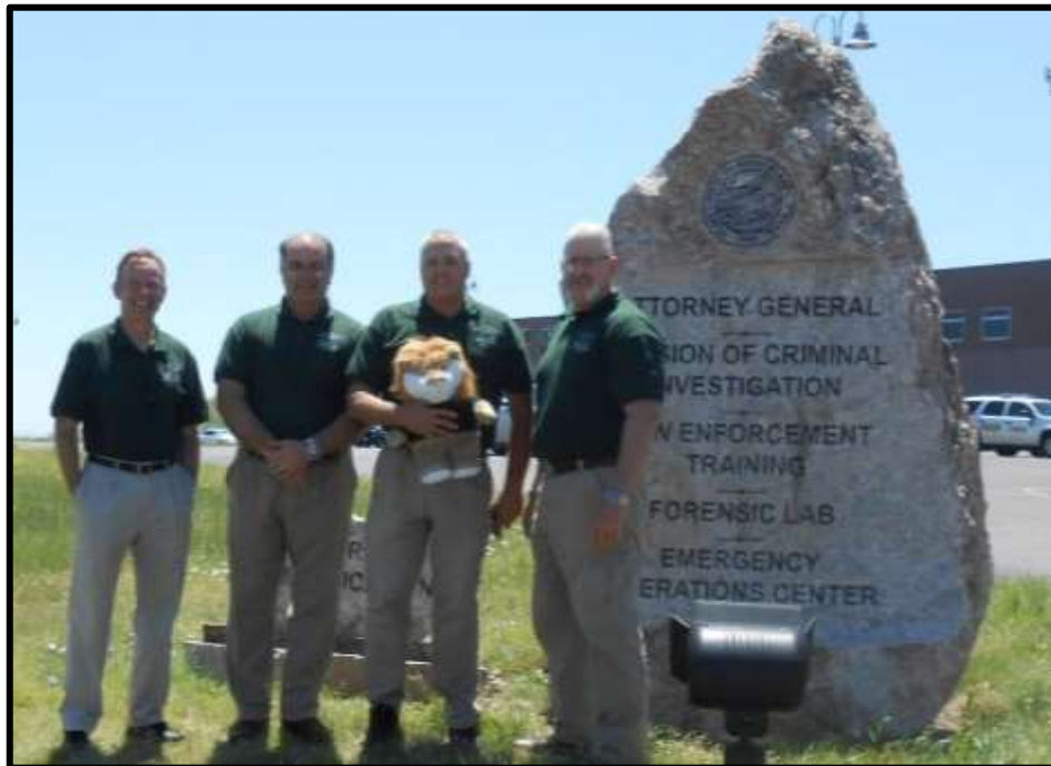
DARE Mentors representing DARE class held June 13, 2016 through June 26, 2016.

An incident cannot be cleared exceptionally if it was previously or at the same time cleared by an arrest.