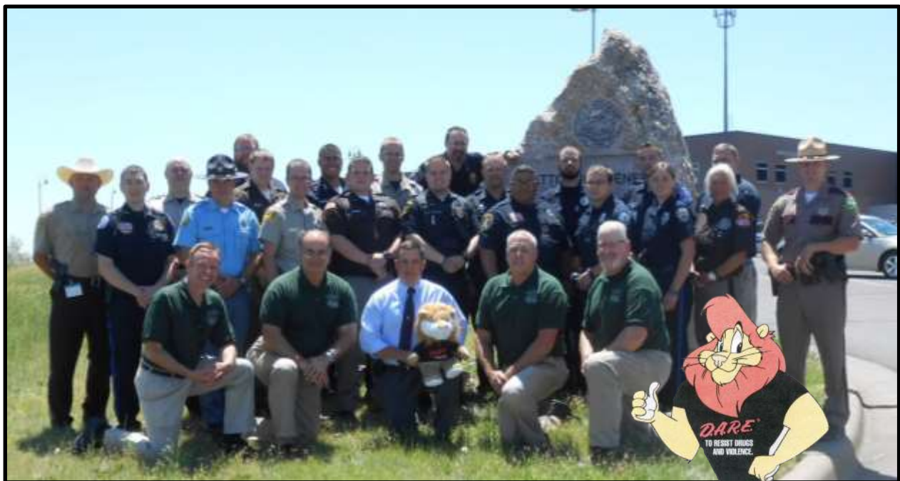
DARE Class held June 13, 2016 through June 26, 2016.